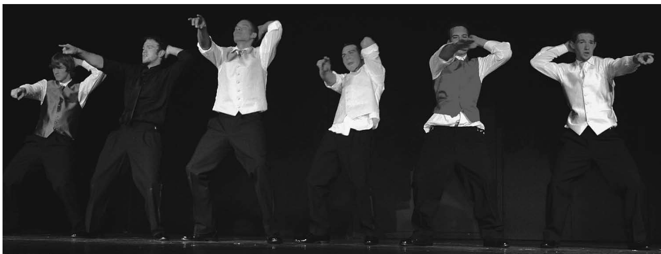
Above: All Mr. Mustang contestants participated in the opening number. It was so popular, they did an encore at the end of the program.