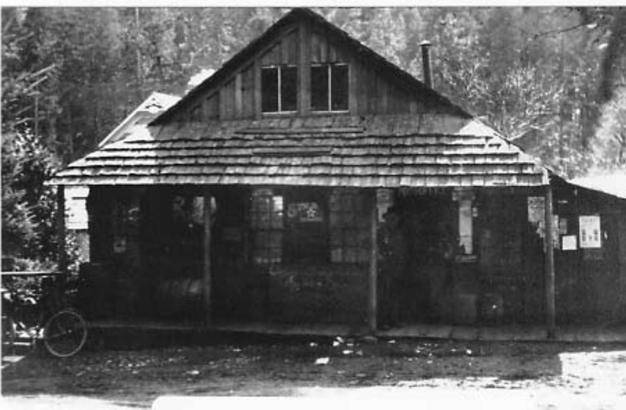
— Original Wonder Store —

NAWPA (North Applegate Watershed Protection Association) 1190 Slagle Creek Road Grants Pass, OR 97527 For more information, see www.SAVEAPPLEGATE.com or call 541-846-1082. Steve Rouse * 541-846-1082