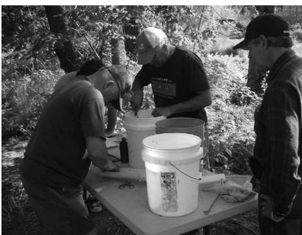
The trapped fish are all carefully returned to the creek.