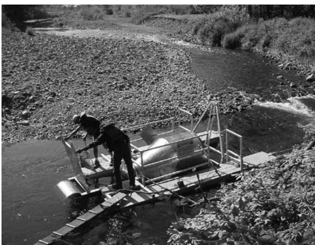
Volunteers remove fish from the smolt trap.