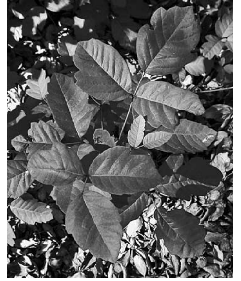
Poison oak ( Rhus diversiloba )

creams or ointments may be applied three to four times a day to reduce the local inflammation. For best effect, topical cortisone creams should be applied after washing the affected area with warm water, patting dry, and then applying a thin layer of medication. Wrapping the skin with a clear plastic wrap after putting on the cortisone medicine also can increase its absorption and effectiveness. In severe reactions, injections or a short course of oral cortisone medicine such as prednisone or Medrol may be needed. Most of the time short-term treatment with these medicines causes few serious side effects. Take medicine with food to help prevent stomach upset from these drugs. Antihistamine drugs can help relieve itching. Oral antibiotics are prescribed if an infection develops, usually indicated by increased redness, swelling and heat.