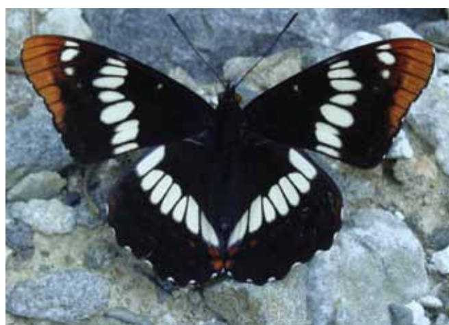
Photos, top to bottom: Western Tiger Swallowtail; California Sister; Loroquin's Admiral.