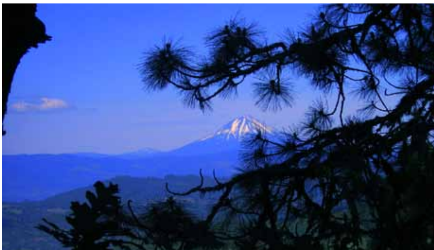
Mt. McLoughlin from Tin Cup Trail