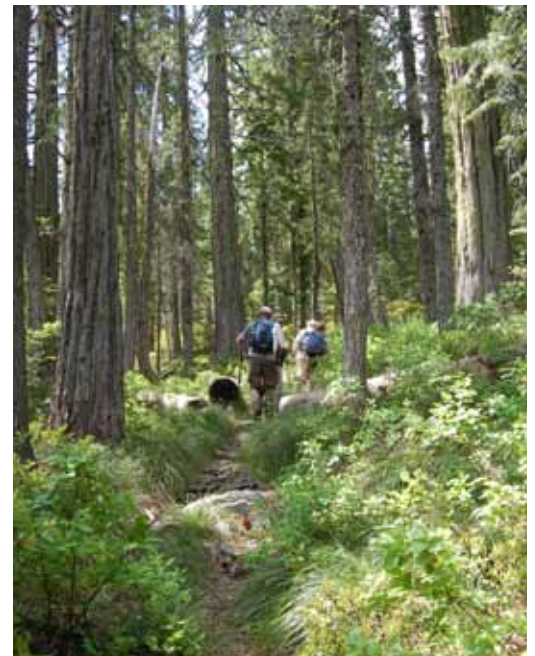
Hiking the Frog Pond Trail