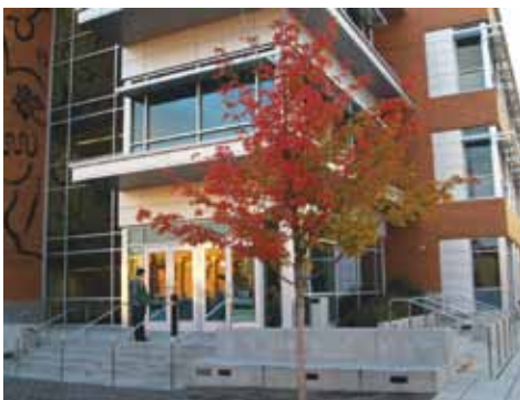
Rogue Community College/Southern Oregon University Higher Education Center, Medford.

What: The 15 th Annual Winter Dreams/Summer Gardens Symposium