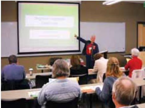
Choose from four 90-minute classroom sessions, plus a catered lunch to chat with the experts.