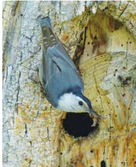
White-breasted Nuthatches move head-first down tree trunks to find insects wedged into the top edges of bark.