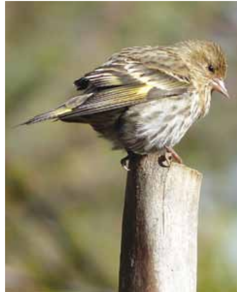
The Pine Siskin is a North American bird in the finch family with an extremely sporadic winter range.