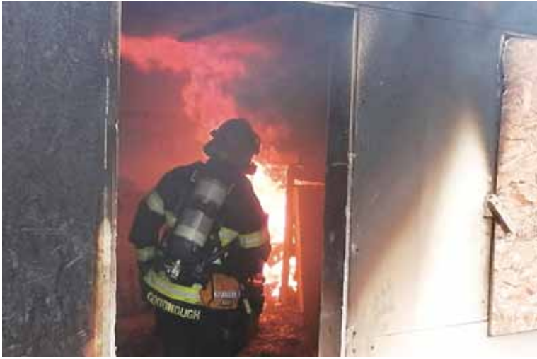
"Burn to Learn" exercise: Battalion Chief Cody Goodnough setting a "room and contents" fire; getting the room full of fuel and fire so that trainees can experience the extreme heat and low visibility of a real structure fire.

so that our fire, emergency and medical needs are the best they can be for both victims and responders? AVFD#9 is unique in that they cover medical, vehicular and other emergencies, plus both structural and wildland fires. Hence the need for a variety of vehicles that can carry hose, medical supplies, water, etc., while still getting up our long, narrow driveways. Over the years a strong fleet of vehicles has been built to cover the district's seven stations across 181 square miles (see map). Do we let them slowly deteriorate?