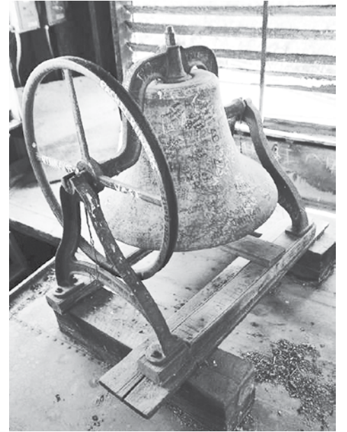
The once-lonely cast-iron bell, ready to be moved during retrofit, is being rung again by happy Applegate School children.

During those years a long rope with a huge knot on the end hung from the bell tower. All those years the rope was never pulled by any student unless it was time to ring the bell. The children had respect for