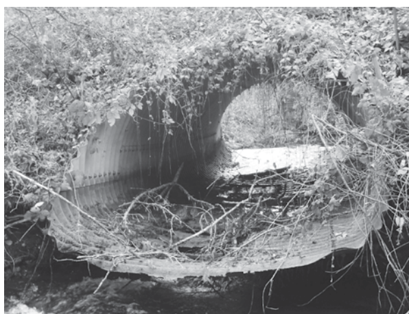
Butcherknife Creek Culvert, a tributary of Slate Creek, is both impassable by salmon and a safety hazard for the landowners crossing it daily.

The Butcherknife Creek culvert is a large, metal arch culvert that provides the main ingress and egress to residents up Butcherknife Creek Road and Onion Mountain Road. The bottom of this