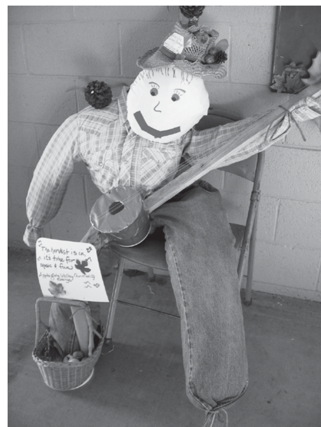
The Applegate Grange entry in Ruch School's scarecrow contest.