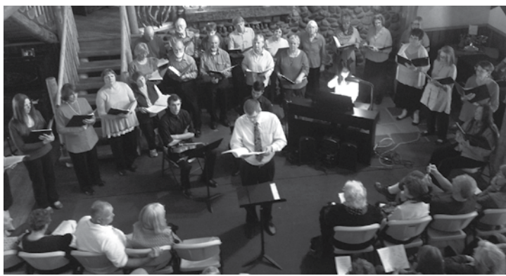
Voices of the Applegate holds concerts twice a year at Applegate River Lodge.