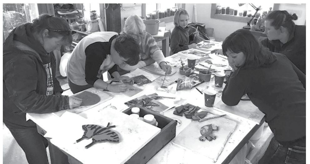
Tile makers for the soon-to-be-completed mosaic mural for Cantrall Buckley Park are hard at work.