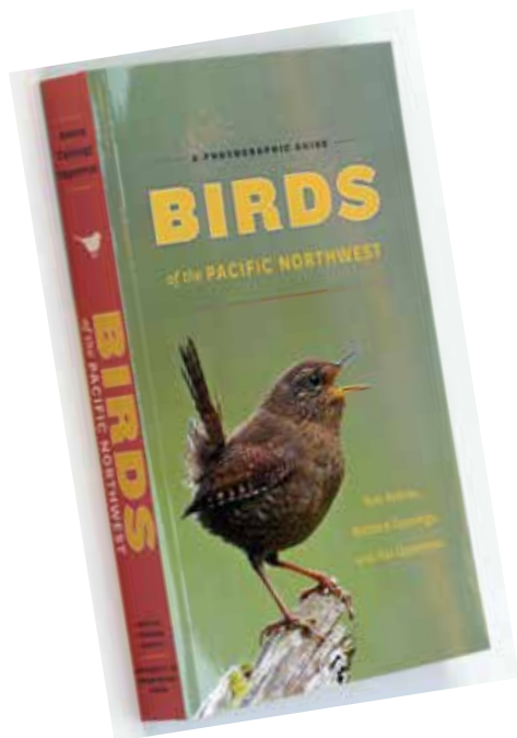
New bird identification book published by the Seattle Audubon Society is available on its website at seattleaudubon.org .