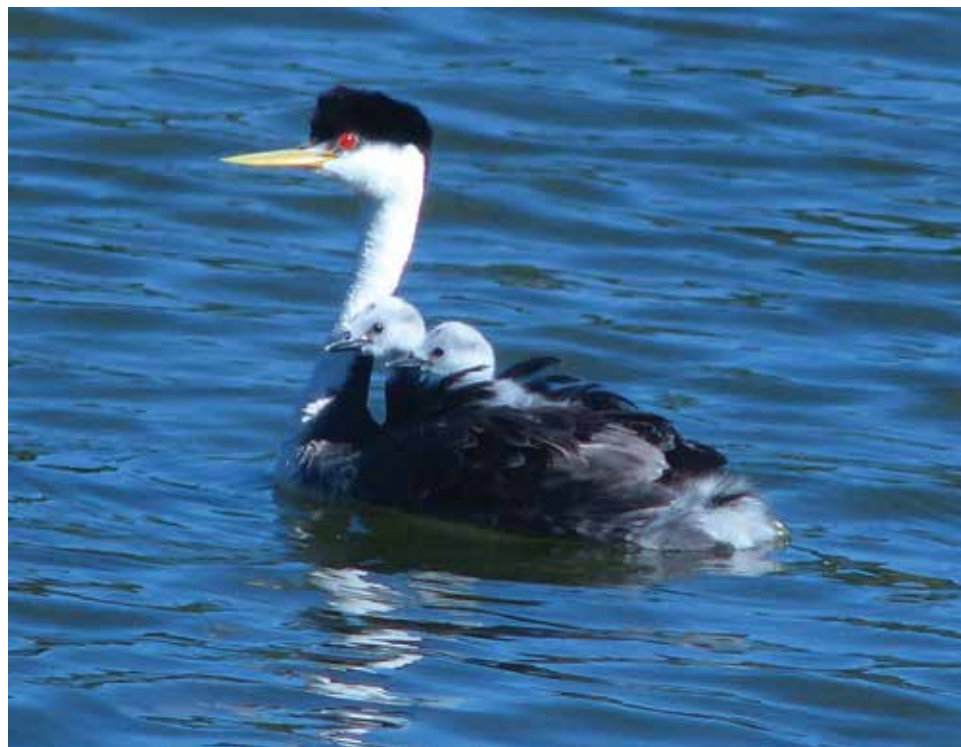
This Clark's Grebe parent gives a ride to its young.