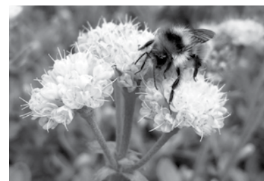
Black-tailed bumble bee foraging on sulphur flower buckwheat.

Klamath-Siskiyou Native Seeds. After a long summer collecting native seeds in the foothills and mountains of the Applegate and beyond, Klamath-Siskiyou Native Seeds has updated its inventory for those seeking locally sourced, wildcrafted native plant seeds. With a focus on flowering native pollinator plants, the motto of Klamath-Siskiyou Native Seeds is "Grow Native, Grow Wild." Online mail-order for packets of native seeds is available, as well as seed-collection contracting for larger amounts of seed. Native plant seeds are used in habitat restoration projects, land stewardship, and gardens of all kinds: pollinator gardens, butterfly gardens, rock gardens, permaculture, food forests, native hedges, ornamental gardens, and more! Support native plant conservation and local, sustainable business in the Applegate Valley. klamathsiskiyou@gmail.com • klamathsiskiyouseeds.com .