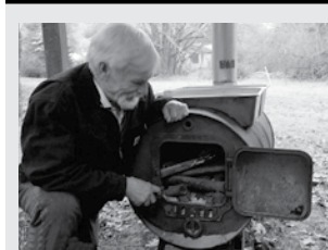
Laird lights off the syrup season.