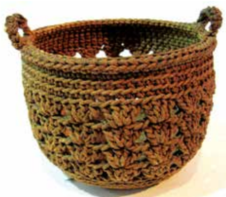
Basket made from hemp (s-media-cache-ak0.pinimg.com).