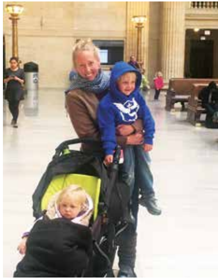
Airline raffle winners in action.

Monarch Waystation at Cantrall Buckley Park is complete! What started out as an idea to help bring more monarch butterflies back to our area has culminated in a wonderful garden that was planned,