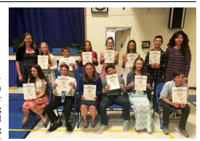
Applegate School's new inductees display their certificates from the National Junior Honor Society.

Capping the Science+ celebration was the induction into the National Junior Honor Society, where hard-working students joined a time-honored and elite society of young scholars whose commitment to academia, citizenship, and leadership are recognized.