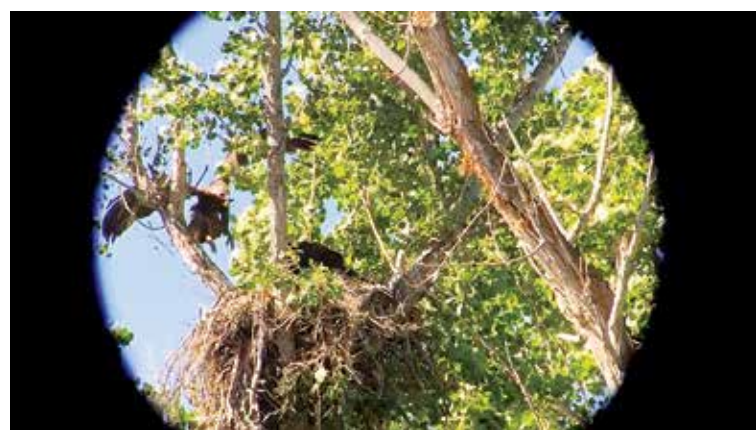
Using a spotting scope adapter on a smart phone, Peter Thiemann captured shots of owls and a golden eagle delivering a ground squirrel to its nest (bottom right photo).