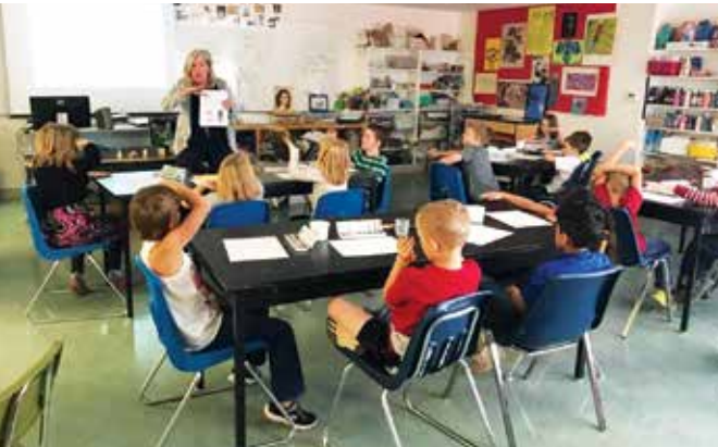
Every Wednesday, the art curriculum at Ruch School focuses on the basic elements and principals of art, introducing students to a variety of mediums and to famous artists. Each class opens with a song that lists the elements: line, shape, color, value, form, texture, and space. Students must evaluate their artwork and to be fluent in art vocabulary. Individual expression

In my previous career, I saw many statistics and graphs concerning which states in our nation spent money on arts programs and which ones did not. Oregon, like California, has a poor track record for supporting the arts on a weekly basis at the elementary level. In middle school, Oregon students have more electives to select from, and some schools actually do have full-time arts educators. Most high schools are likely to provide a broader arts program. The catch here, of course, is that if students are not given the basic fundamentals of art at an earlier age, their comfort level might be lacking and they may be more likely to select an elective other than art. We all lean toward the subjects in which we feel strongest and tend to avoid the areas in which we may feel deficient. Therein lies our nation's general lack of comfort when it comes to art, art history, and individual creativity. Many Applegaters are familiar with the story of how Ruch Community School nearly closed. This community rallied to save it and continues to lend its support. Today, this rural school continues to provide a level of excellence to all children