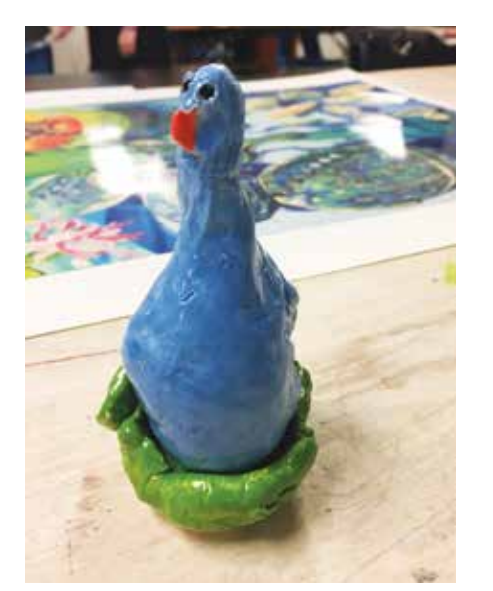
Ceramic art piece created by first-grade student.

who live in the greater Applegate area. The school's PTO manages funds from an annual auction that supports unique and needed programs, including the visual and performing arts at Ruch School.