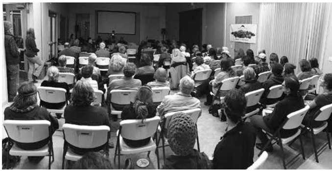
Attendees at a February session of "The Future of Soil: Ensuring Resilient Food and Agricultural Systems," sponsored by Our Family Farms, a local nonprofit organization.

Farmers, ranchers, and gardeners in the Applegate, and everywhere for that matter, rely on soil to grow crops and provide the forage and pasture to raise animals. The health of our soil, therefore, is paramount to food and fiber production. Between February and June this year, Our Family Farms, a local nonprofit, is bringing together national