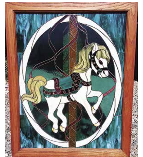
Photo, left: Some colorful items donated by Applegate residents. Photo, right: FOTAS has gifts for pony fans!