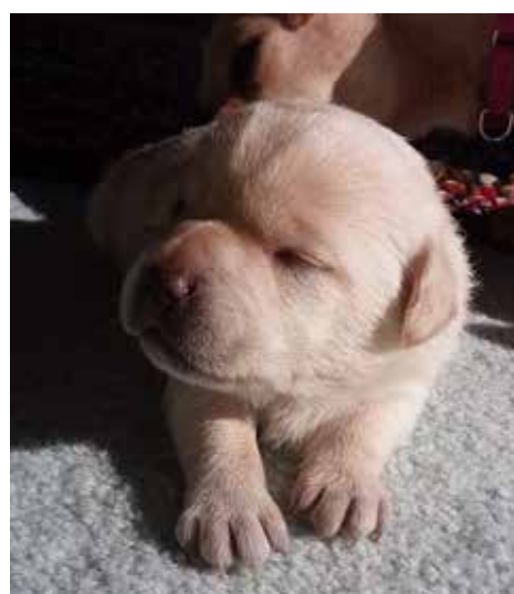
Puppy fostered in the Applegate.

As of the deadline for this edition, 18 of the 50 confiscated or abandoned dogs in the shelter came from Applegate Valley. That is 36 percent. No, these are not dogs that "outsiders" dumped here. (These numbers are the author's first-hand head