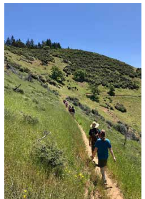
Hikers on the east Applegate Ridge Trail.

count and do not include dogs "on hold" to see if owners may claim them.)