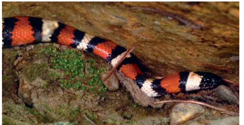
A California mountain kingsnake.