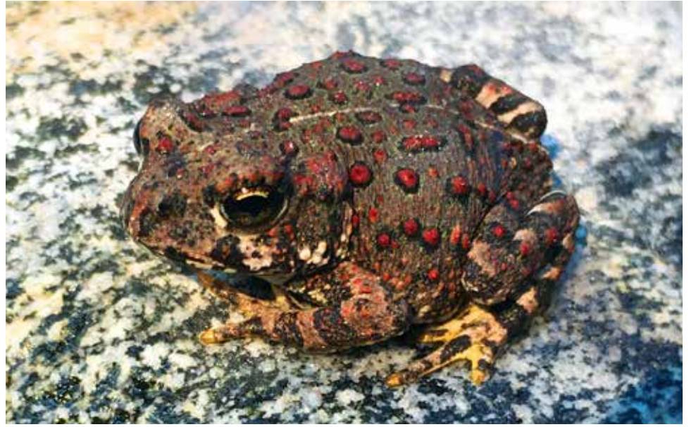
A western toad.