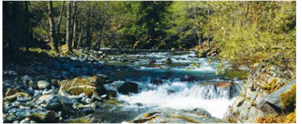
The Middle Fork of the Applegate River dips south of the Oregon-California border above Applegate Lake.

The giant salamander is the jewel of the Pacific Northwest, the largest species of salamander in North America. It is