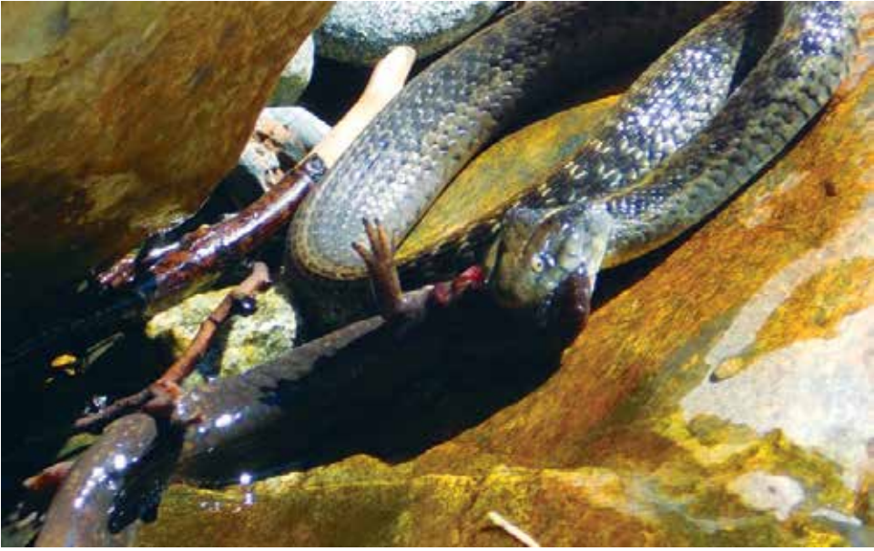
A Pacific aquatic garter snake feeds on a Pacific giant salamander.