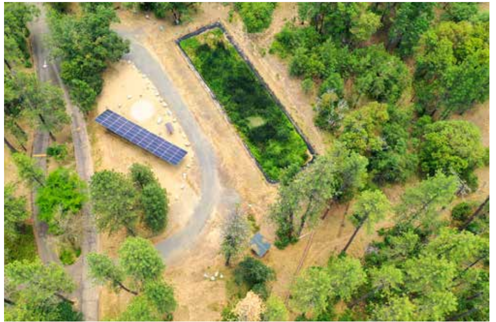
This aerial photo shows the solar site at Cantrall Buckley Park with a 52-panel array which has shaded area for public use under it and a 20 foot-diameter sundial on which people can stand and see the time. In a rectangular area across the drive a developed wetland with plants that filter grey water from the park is visible.

A Greater Applegate, team members of the volunteer Park Enhancement Program, and staff of Jackson County Parks want to extend our deep gratitude to all the community members, volunteers, and donors supporting Cantrall Buckley Park. We are hopeful that circumstances will change in the future, enabling us to host our park enhancement celebration to showcase and share all the beauty and enhancements you have supported to make this park stand out as a "gem" in our county. However, due to the current health restrictions and safety concerns for everyone, we are cautiously looking