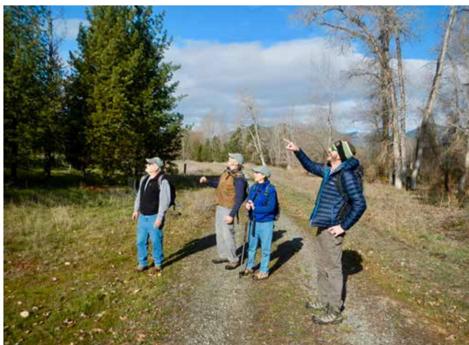
Birders enjoy an outing at the Provolt Rec Site.