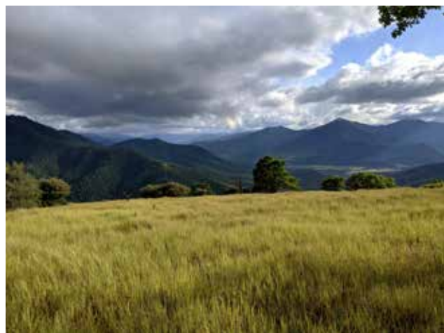
One of many striking views from the East Applegate Ridge Trail. The full ART is envisioned to run from south of Jacksonville all the way to Grants Pass.

The current ATA board is energized (although we need more of us!) and working to maintain and improve the amenities for the East ART. We are working with the BLM to move the second major section of the ART forward. The 13-mile Center ART will start from Highway 238, at the East ART trailhead