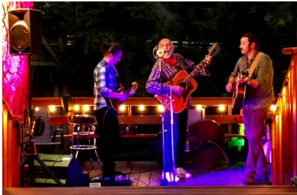
The Applegate String Band strumming it up at the Almeda Fund Raiser.