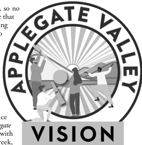
Back to the vision-drawing board: Outdoor gatherings are planned in Applegate Valley neighborhoods so residents can share ideas about the community's future.

Our popular Small Business Technical Assistance program, funded by Business Oregon, has been extended until June 2021! Designed to support local businesses impacted by the pandemic, this program provides Applegate Valley businesses and startups with free support to sustain or grow your business during this extended challenging time. Local businesses have used this program to develop a marketing or communication plan, design or upgrade a website, set up online bookkeeping