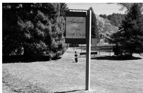
Applegate River Golf Club is along the Applegate River at 7350 New Hope Road in Josephine County.