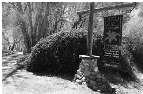
Red Lily is four miles west of Ruch on Highway 238.