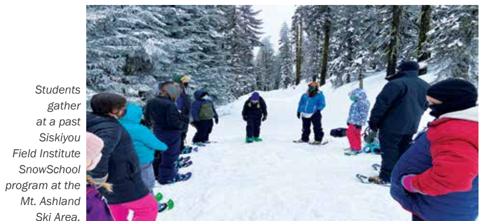
Students gather at a past Siskiyou Field Institute SnowSchool program at the Mt. Ashland Ski Area.