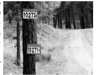
Additional directional signs direct visitors to the correct address.

suggests cleaning your home’s gutters as soon as possible this spring. He then suggests doing this again on a dry day later this upcoming winter. After that, you won’t have to clean the gutters again until next winter! Much more comfortable than getting up on a ladder in the summer heat!