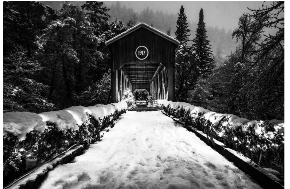
McKee Bridge bedecked with Christmas finery.