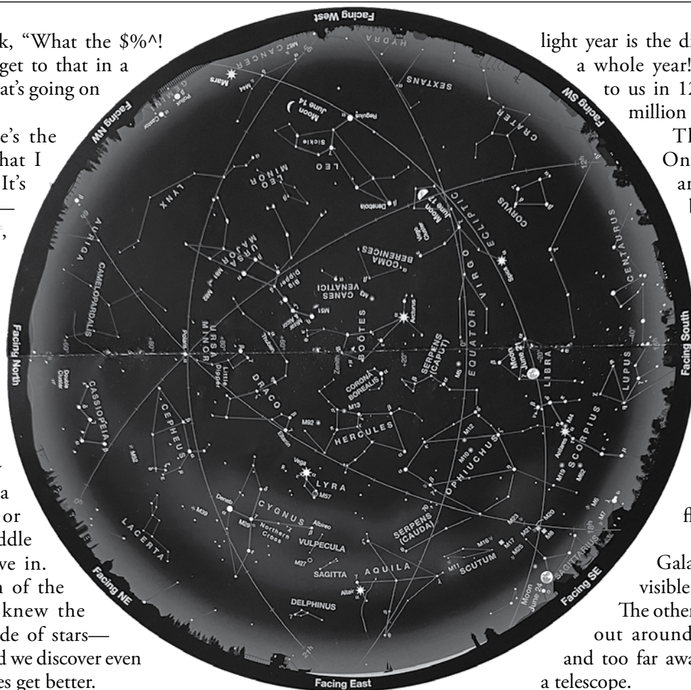
Sky & Telescope ( skyandtelescope.org ).

Ed. Note: For more information about Ruchbah the star, visit star-facts.com/ruchbah .