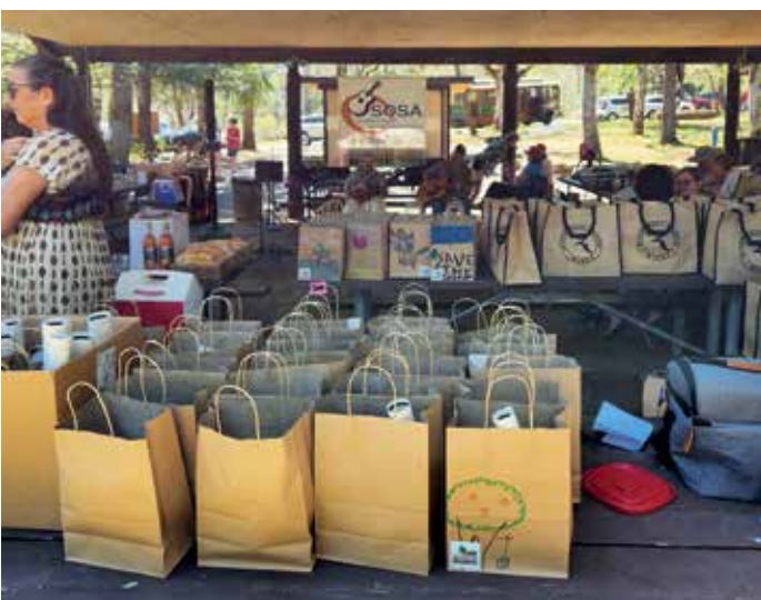
Volunteers and donors were honored and thanked at the Cantrall Buckley Park Celebration. Elementary students decorated gift bags and RiverCrest Ranch provided special thank-yous to legacy donors.