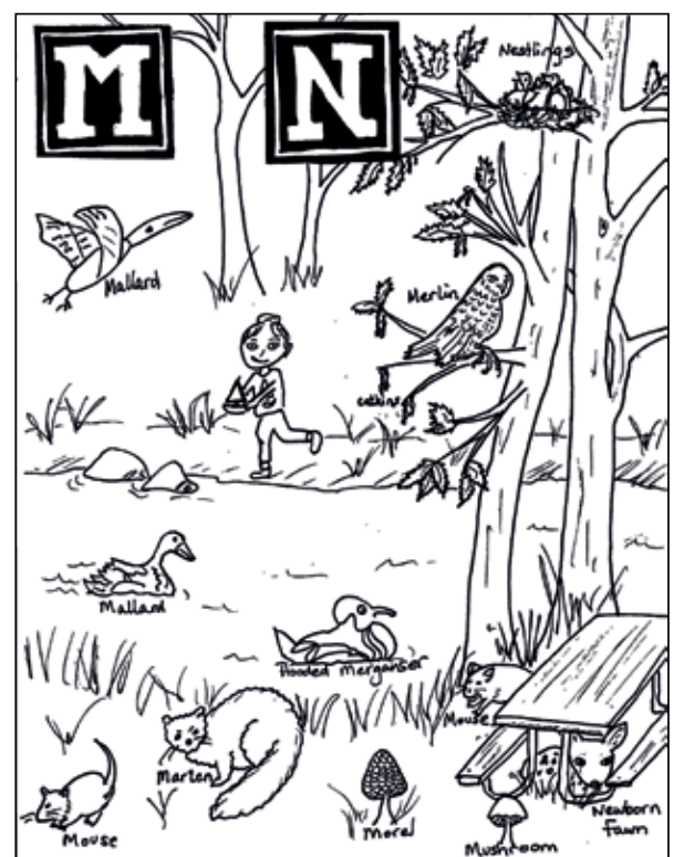
The M-N page from the Cantrall Buckley Park Coloring Book.

While we strove for accuracy, we went along with a little whimsy, as well. The book is peppered with self-portraits of children playing in the park, walking dogs, and so much more than just raw scientific