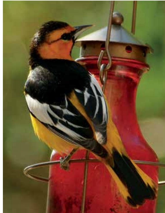
Bullock's Oriole perched on author's deck feeder in the Applegate.

For the first time since watching birds in the Applegate Valley, I have had several Orioles come to my bird feeders this spring, attracted to suet and hummingbird nectar. What a spectacle! Up to four male Orioles and many Black-headed Grosbeaks came to