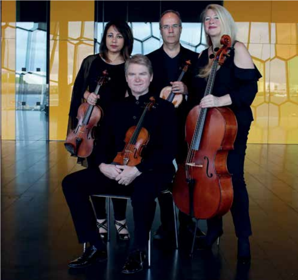
Quartet ES, an internationally known string quartet, will play at Jacksonville City Hall in January.