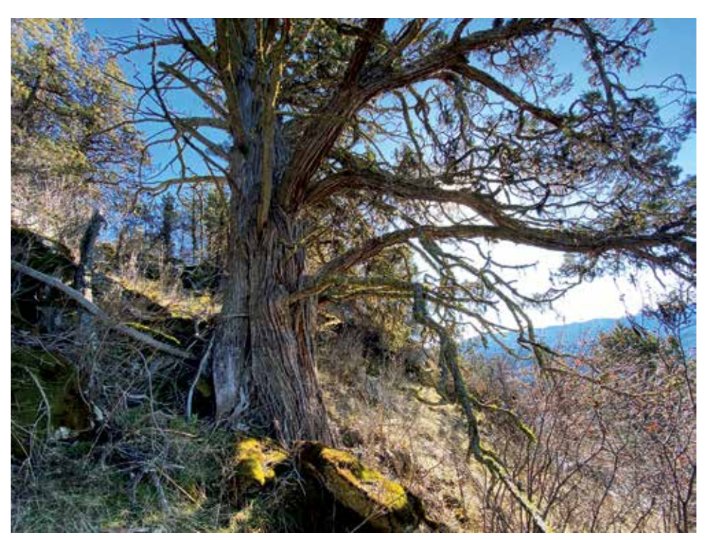
A massive old-growth Western juniper on the face of Anderson Butte.

The Siskiyou Crest White Paper Series is a volunteer-based, citizen-science program. Our goal is to make reports that are both academically meaningful and accessible to the public. We aim to build appreciation for the region by