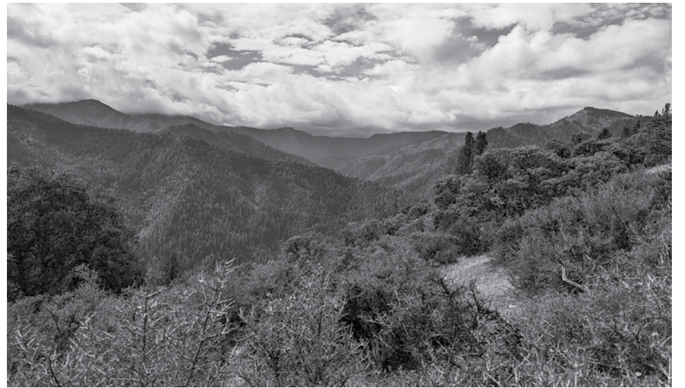
View from Elliott Ridge.

Progress to date. Commercial thinning is currently progressing in units 62, 63, 67, 68, 109, 110, and 111. Two hundred fifty acres of felling are complete in units 63, 67, 68, and 110, and 20 acres have been yarded via helicopter, resulting in 485 tons of material removed. Due to recent weather patterns and mechanical issues with the helicopter rotors, progress has been slower than anticipated. However, Lomakatsi, the US Forest Service, and Timberline Helicopters remain committed to treating commercial units in UAWRP. We anticipate progress to increase as weather conditions improve.