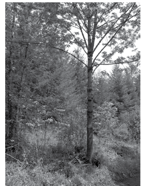
Figure 3. This bigleaf maple tree originated from a center sprout. The other sprouts helped train this residual sprout and then they were cut away. This tree could now be pruned up further (to the fork) to produce clear, high-value sawtimber.