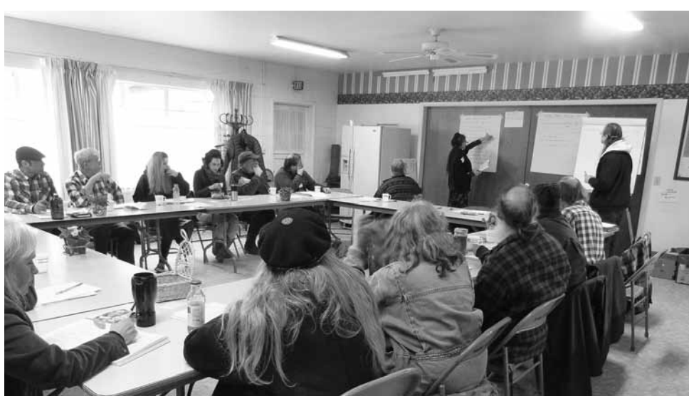
Members of Applegate Valley Community Grange at February retreat.

The membership of the Grange met in early February for a retreat in which we came together as a group to define our short-term and longterm goals for the Grange. This was an important event for the Grange—a chance to retreat and take a look at our priorities. It was an important teambuilding exercise and we feel energized