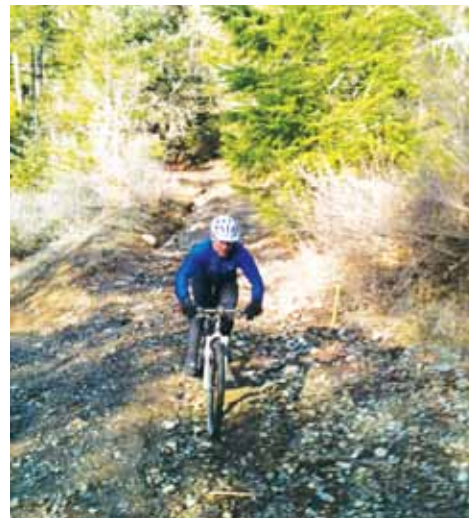
Enjoy mountain biking in southern Oregon.

• Running. A few years ago Rogue Valley Runners staged a nationally highlighted cross-country run through the Applegate—from Williams to Ashland, up mountains and down. You can run anywhere in the Applegate, but be careful on the roads. Shoulders are very narrow and gravelly.