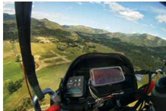
The international Rat Race 2016 paragliding competition at Woodrat Mountain will be held on June 19 - 25 ( http://mphsports.com ).