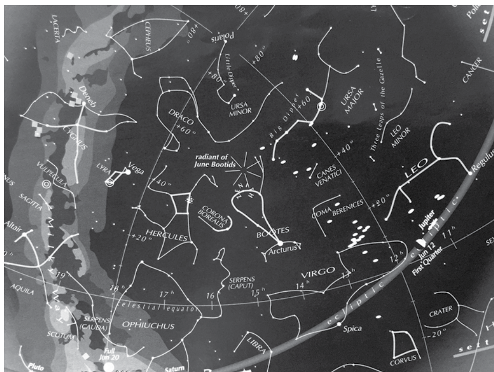
Illustration: Guy Ottewell's Astronomical Calendar 2016.

Have you seen the Gater's ONLINE CALENDAR?