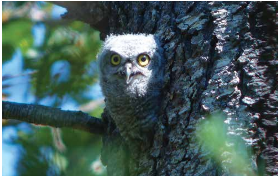
Photo, top left: Four young Western Screech Owls (WSOs) in Lithia Park. Young WSO (above) peeking out of snag hole, and adult WSO (bottom left) roosting in woodpecker cavity on the author's property in the Applegate.