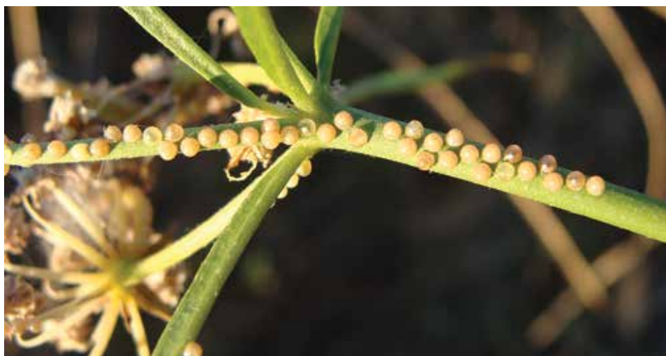
Clio Tiger Moth eggs on narrowleaf milkweed.

Kristi Mergenthaler, with Southern Oregon Land Conservancy, describes the "magical" RRP: Rogue River Preserve is a 352-acre property located north of Eagle Point that features two miles of riverfront, an amazing and diverse floodplain property with forests, oak woodlands, meadows, and vernal pools. It supports 29 species of plants and animals that are rare and declining, such as coho salmon (spawning and rearing habitat), wood duck, common king snake, and large-flowered meadow-foam. Southern Oregon Land Conservancy, a local land trust that works cooperatively with people to preserve land, is in the process of raising funds to buy this wild valley-floor property for long-term conservation. For more information or to make a donation, visit landconserve.org/heartoftherogue .