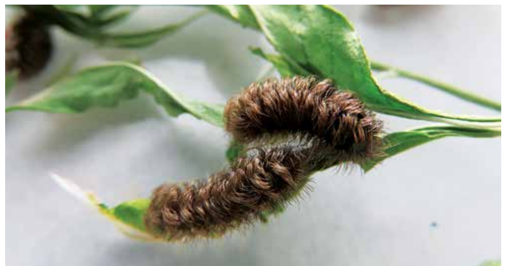
Clio Tiger Moth caterpillars reared from eggs found at RRP.