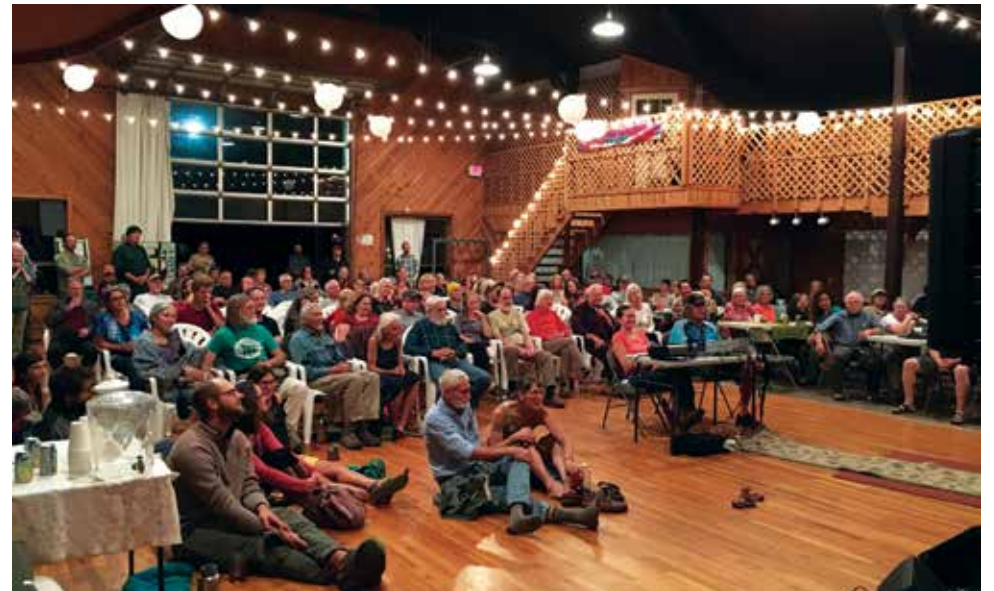
Photo above: A large crowd at Pacifica sits enthralled, watching Walking the Wild Applegate .