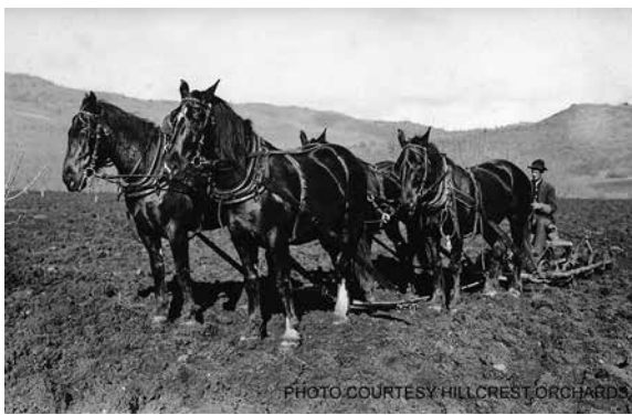
Horse-drawn plow circa 1910.

The National Endowment for the Humanities Common Heritage Program funded the Stories of Southern