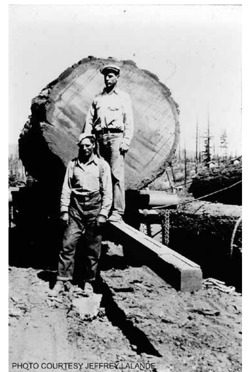
Logging near Butte Falls circa 1940.