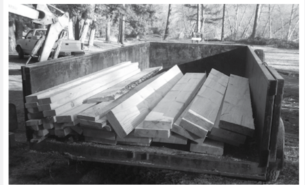
Top photo: Chuck Dahl on his way to the top of a huge ponderosa pine. Bottom photo: Wood from the pine tree is being milled to make new picnic tables.